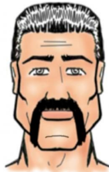
Fu Manchu Mustache