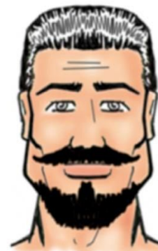
Goatee & Wide Mustache