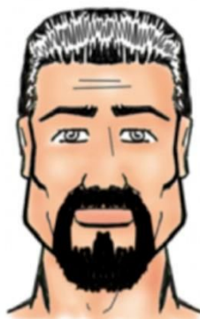
Goatee & Narrow Mustache