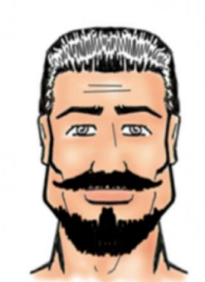
Goatee & Narrow Mustache Goatee & Wide Mustache