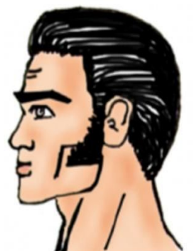
Extended Side Burns